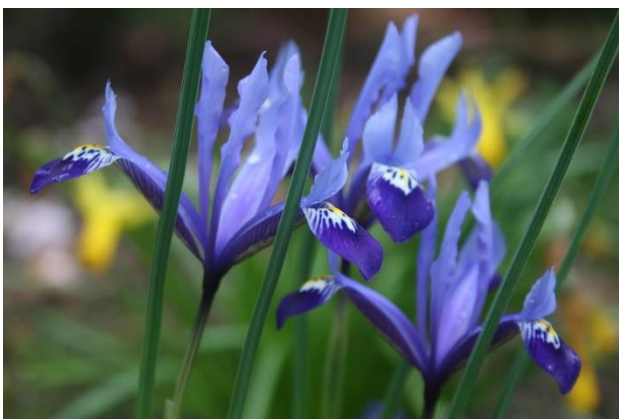
Left: Iris reticulata Alida .

Dwarf, colourful and enjoying a dry Summer climate these are the reticulate irises. ‘Reticulate’, meaning netted refers to the netted fibrous skin of each bulb. When these lands are deep in snow the irises are dormant, but they grow quite well in places where no snow falls. What they do need is a dry Summer rest though it must be understood they will not tolerate a hot resting period.