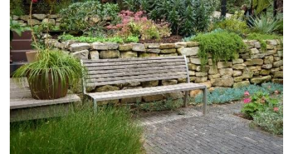
Working Person's Garden , Burnside