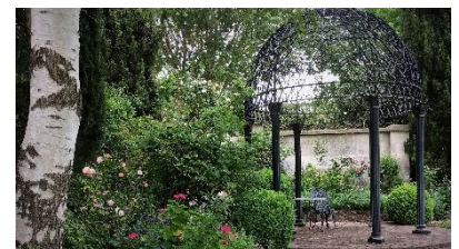
Sheriffmuir Garden , Mount Gambier