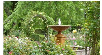
Ashgrove Iris Garden , Gumeracha