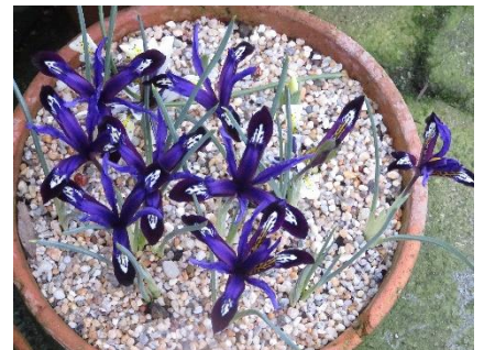
Above: Iris reticulata Spot On .