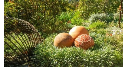
Casuarina , Mylor

SPECIAL EVENT – Gumnut Wreath Workshop , Mitcham