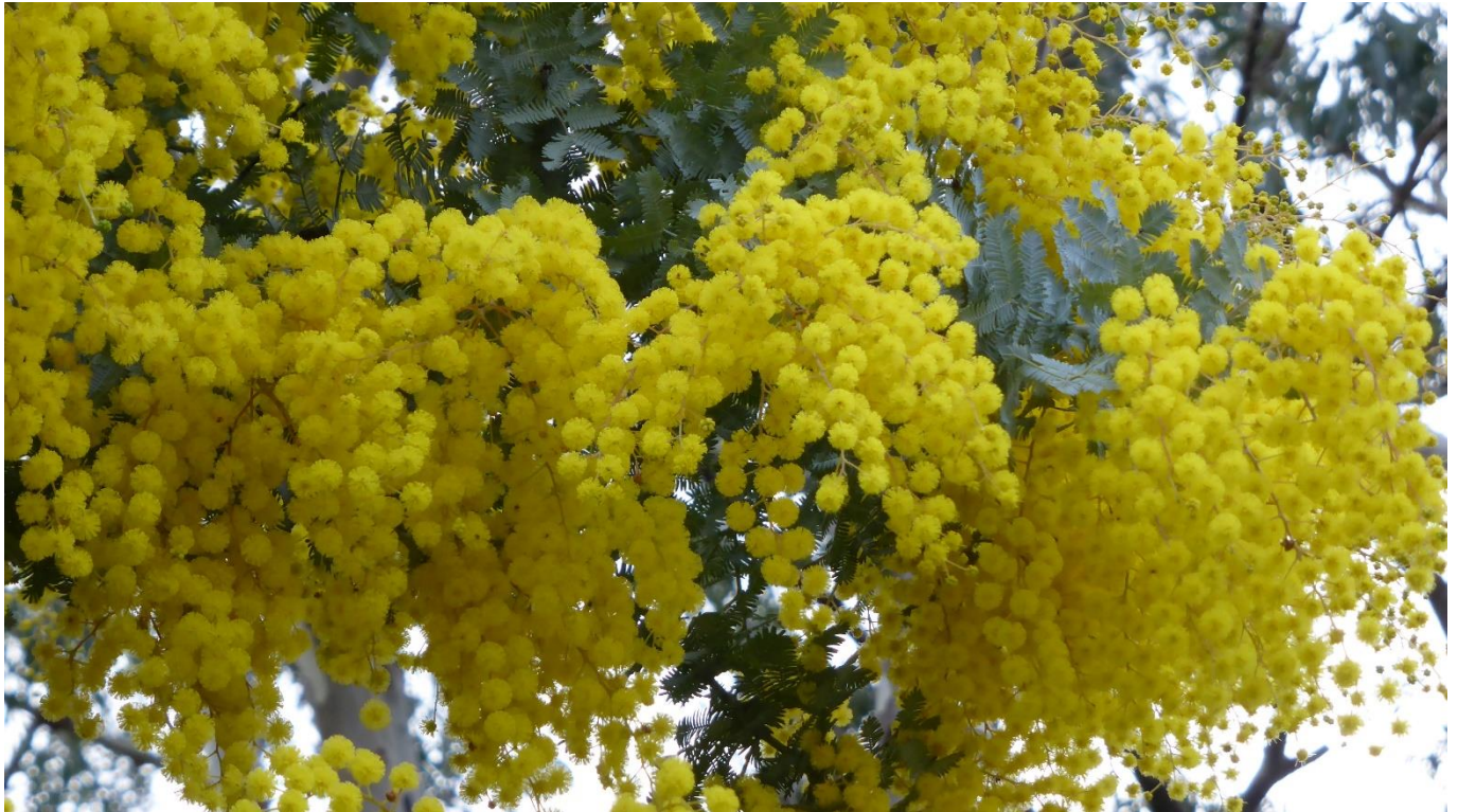
Early Spring Blossom –Wattle photographed in the Adelaide Hills.

Open Gardens South Australia is a not for profit organisation opening private gardens to the general public.