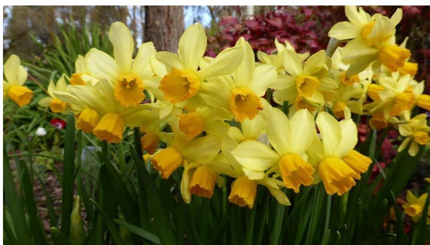
Daffodils signal that Spring has arrived!

The Corona virus, COVID-19, continues to bring us challenges and testing times in many aspects of our lives – including our plans to open gardens for the public to visit and enjoy. We hope you are remaining positive and have been able to spend quality time in your own gardens. Spring brings a welcome change to the weather, particularly as we seem to have had a very cold winter! The gradual lengthening of the days, some warmth in the sunshine and the emergence of spring blossom and bulbs will help lift our spirits and brighten our days. We hope you enjoy our spring Newsletter!