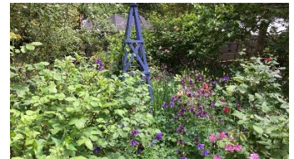
Berkeley Vale , Stirling