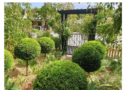
Chez Nous , Birdwood