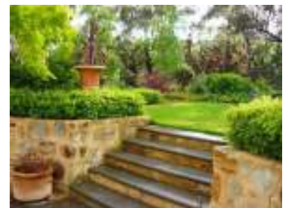
The Garden at Wilpena Street, Eden Hills