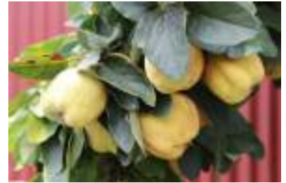
Anna's Garden, Clarence Gardens