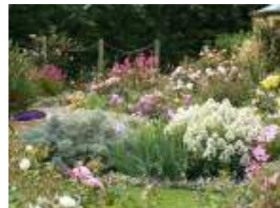
Taringa Park, Middleton