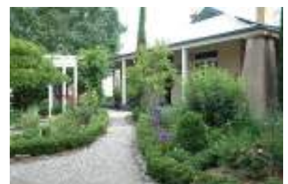
Clear View, Aldgate