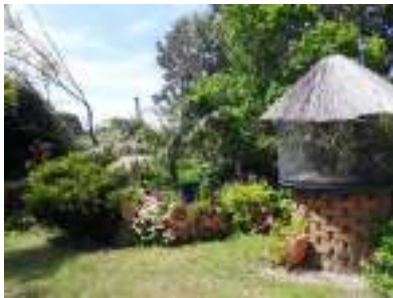
Cockatoo Cottage, Kingscote, KI