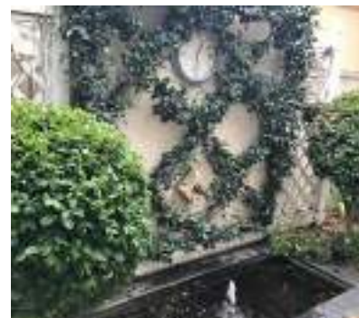
Crabapple Cottage, Leabrook