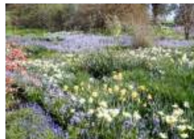
Avondale, Rhynie, near Riverton