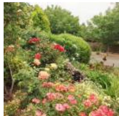
The Bonney Garden, Golden Grove