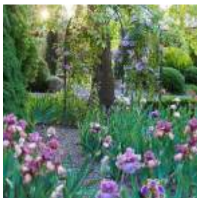
Ashgrove Iris Garden, Gumeracha