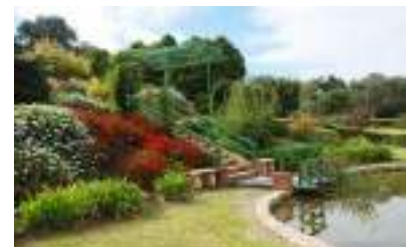
The Olives, Yankalilla