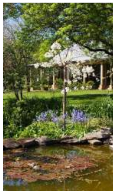
Al-Ru Farm, One Tree Hill