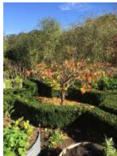
Ising Cottage, Crafers West