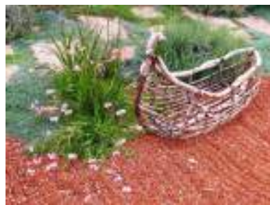
Etre, Spring opening, Willunga

Open Gardens South Australia is a not for profit organisation opening private gardens to the general public.