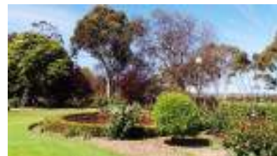
Arana, Kingscote, Kangaroo Island