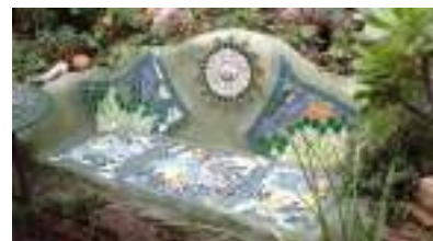
Tickletank, Mount Barker