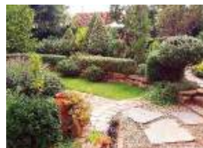
Estella, Myrtle Bank