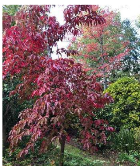
Again, Please Note: This is Not an Open Gardens SA hosted event, and all enquiries must be directed to the Adelaide Hills Garden Affair organisers.