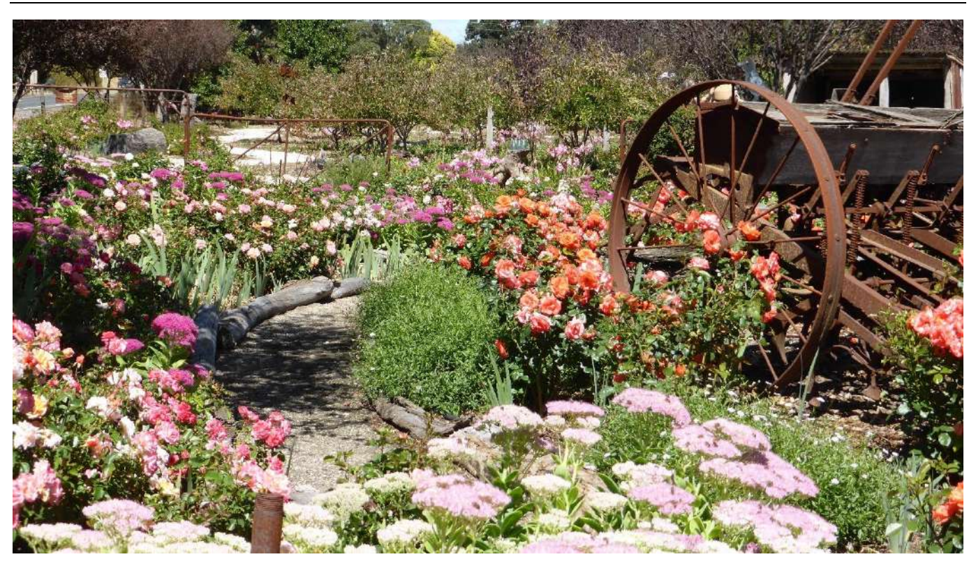
Frosty Flats - 2891 Onkaparinga Valley Road, Birdwood, open 09 & 10 March 2024.

Open Gardens South Australia is a not-for-profit organisation opening private gardens to the general public. The purpose of Open Gardens SA is to educate and promote the enjoyment, knowledge