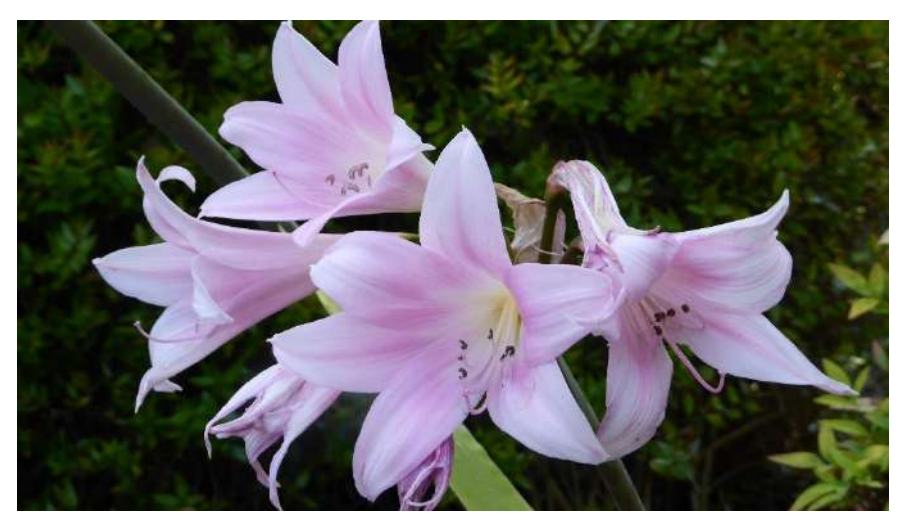
Autumn Flowering Bulbs - Belladonna Lilies

Welcome Autumn! While many of our gardens look at their spectacular best in Spring, Autumn is the favourite time of the year for many people – including many gardeners! The seasonal breaking rains and cooler conditions in Autumn are a welcome relief. Our Autumn open garden program includes some familiar favourites as well as some gardens new to Open Gardens SA. We hope you will visit and find some inspiration and enjoy the gardens. Our Newsletter, as always, includes some interesting articles which we hope you will enjoy. Happy reading!