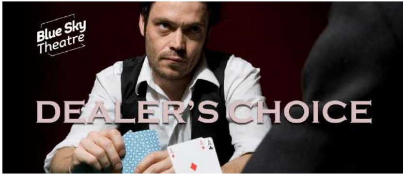
Life's not about the cards you're dealt but how you play the hand.

Open Gardens SA is very privileged to have an ongoing collaboration with Blue Sky Theatre in presenting Theatre in the Garden performed in a delightful garden setting each Summer. This collaboration is greatly valued and appreciated by Open Gardens SA and is a wonderful inclusion in our annual program of activities! We thought our readers would be interested in the Winter performance from the talented Blue Sky Theatre cast and crew.