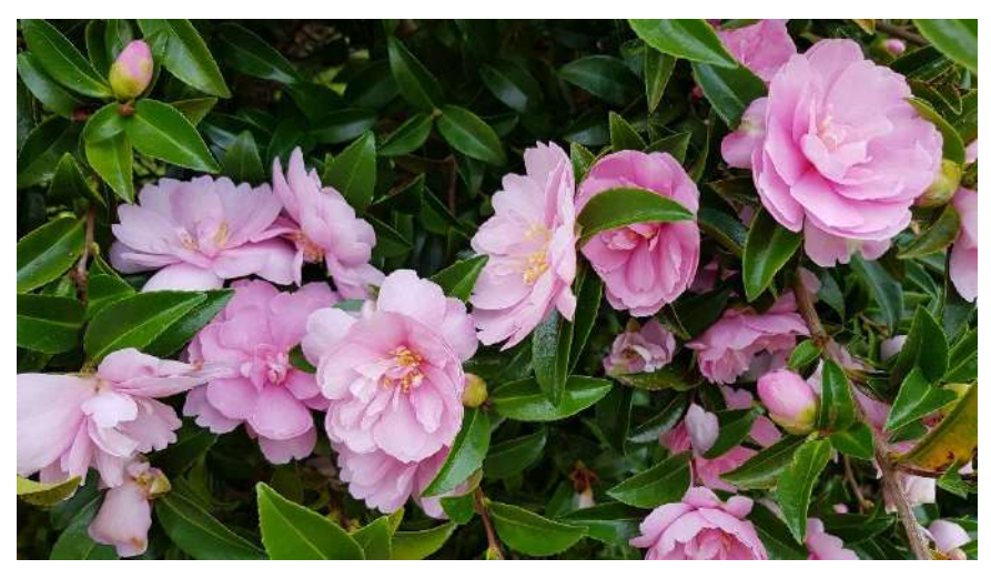
Beautiful Camellia flowers at Stangate House and Garden, Aldgate, Adelaide Hills.

It's Winter – chilly and wet days can be challenging when there are jobs which need attention in the garden. There is a view that there is no such thing as inappropriate gardening weather – just an inappropriate choice of gardening attire, but if it's raining and cold, indoor jobs might be a better choice! Open Gardens SA doesn't usually open gardens during winter, however we use this time to plan and organise our spring program of open gardens. Winter also is the time to hold our Annual General Meeting and organise our information gettogether for the owners of the gardens opening for the next season. We hope you enjoy our Winter Newsletter.