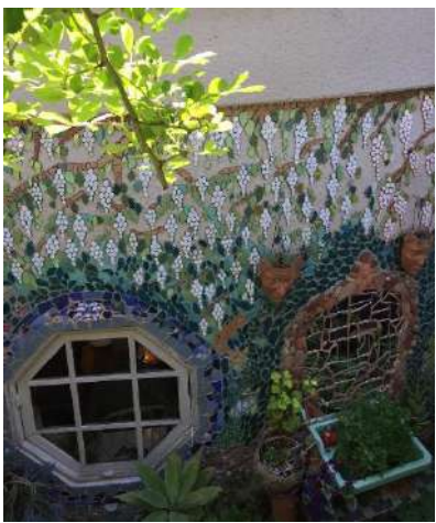
Tickle Tank – Mt Barker