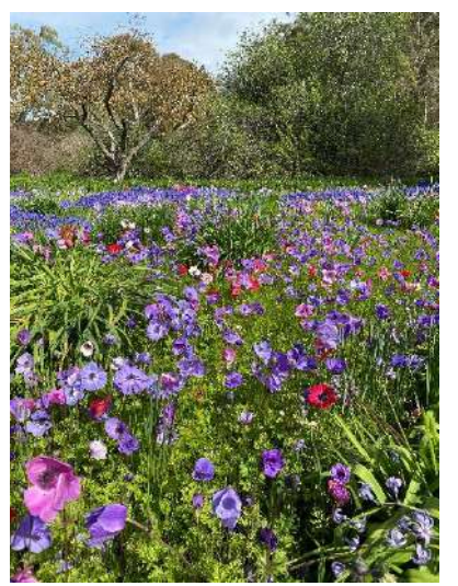
Avondale - Rhynie

Marybank Farm – Rostrevor. Marybank Farm sits on the hills face with views through massive old red gums to Adelaide. Both the picturesque Georgian style house built in 1842 and the very old garden are Heritage Listed. A large lawn and traditional garden beds surround the house with meandering informal walks leading through another 5 acres. A long straight path planted on one side with roses and perennials leads to the vineyard and from a seat at the end, there are stunning views back to the house with the imposing form of Black Hill in the background. Size: 6 acres.