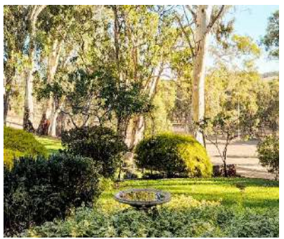
Skilly House Garden – Watervale