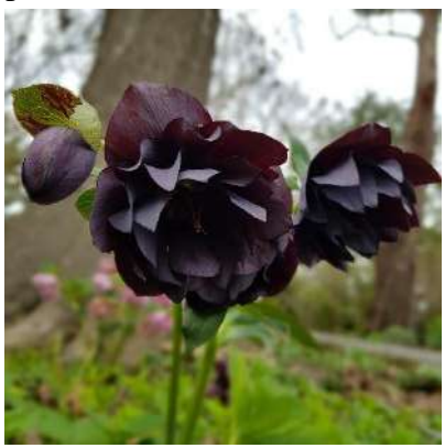
All helleborus plants are toxic, and all parts of the helleborus plant are toxic.

Double-flowered hellebores provide a very interesting variation to the standard hellebore. They are generally easy to maintain and share the same planting conditions as the standard hellebore. Semi-double flowers have one or two extra rows of petals; doubles have more. Their inner petals are generally very like the outer ones in colour and patterning. They are often of a similar length and shape, though they may be slightly shorter and narrower, and some are attractively waved or ruffled. By contrast, anemone-centred flowers have, cupped within the five normal outer petals, a ring of much shorter, more curved extra petals (sometimes trumpet-shaped, intermediate in appearance between petals and nectaries), which may be a different colour from the outer petals. These short, extra petals (sometimes known as "petaloids") drop off after the flower has been pollinated, leaving an apparently single flower, whereas doubles and semi-doubles tend to retain their extra petals after pollination.