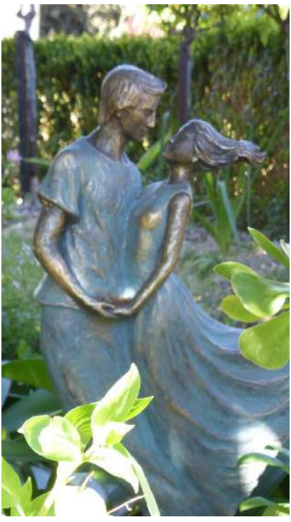
Marybank Farm – Rostrevor