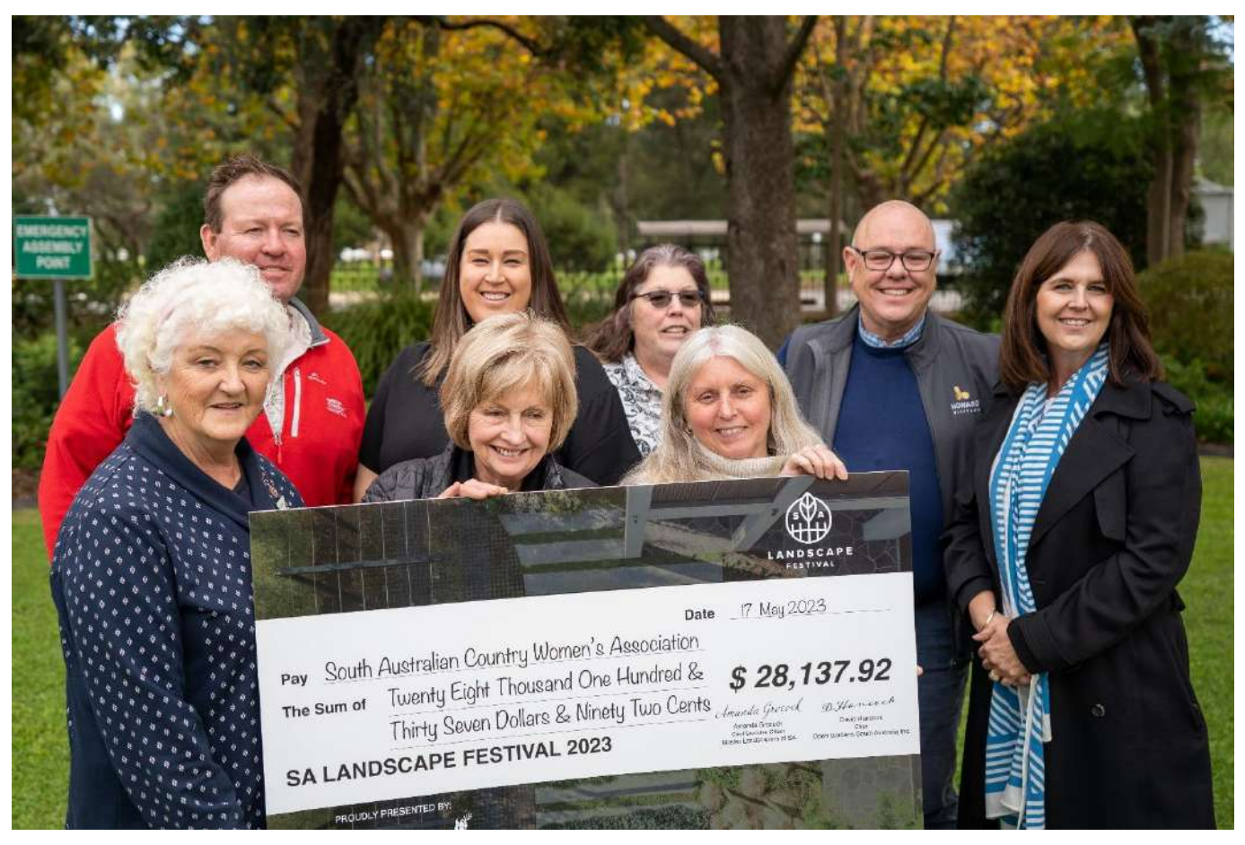
SA Landscape Festival – cheque presentation to the SA Country Women's Association.

Open Gardens South Australia is a not for profit organisation opening private gardens to the general public.