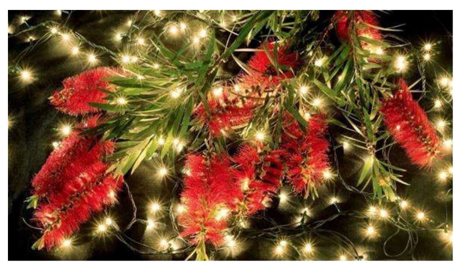
Festive Bottlebrush for Christmas!

This Summer is predicted to be hotter and dryer than recent years – our summers' can be harsh, and gardening can become a challenge! However, Open Gardens SA still have a wonderful program of summer gardens for you to visit – however we do open fewer gardens due to the heat as we look forward to milder conditions in Autumn. Please support our summer gardens as the owners are very generous in sharing their gardens with the public. Our Newsletter, as always, includes some interesting articles which we hope you will enjoy! And finally, the management committee of Open Gardens SA wishes you and your loved ones a peaceful and content Christmas holiday season and New Year.