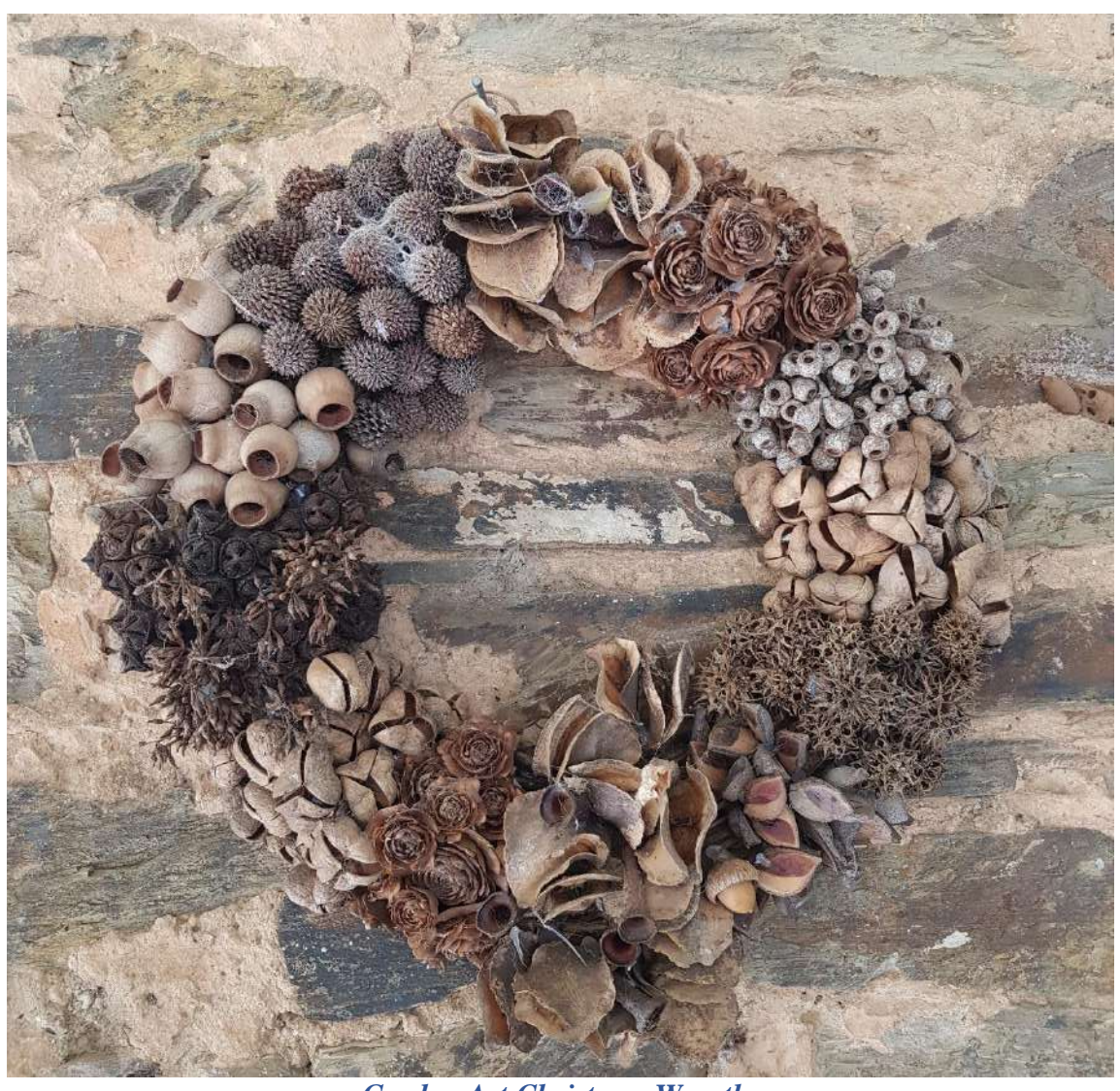
Garden Art Christmas Wreath.

Open Gardens South Australia is a not for profit organisation opening private gardens to the general public. The purpose of Open Gardens SA is to educate and promote the enjoyment, knowledge